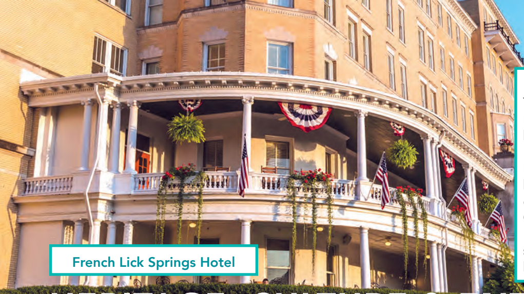
French Lick Springs Hotel

French Lick Resort Two historic hotels make up this grand resort; French Lick Springs Hotel, built in 1901 and West Baden Springs Hotel, built in 1902. Over $600-million has been put into the restoration to bring the properties back to their original grandeur. World-class Spas, Championship level Golf, Shopping & Dining on site. Complimentary shuttle service allows guests to circulate between properties at their leisure.