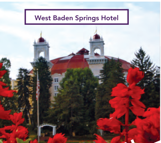
West Baden Springs Hotel